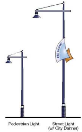
Corridor Illumination (Along the entire S. 216th St. Project Area)